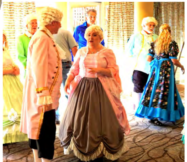
The exhibition groups are so much fun to watch at the conventions and here are two of the best.