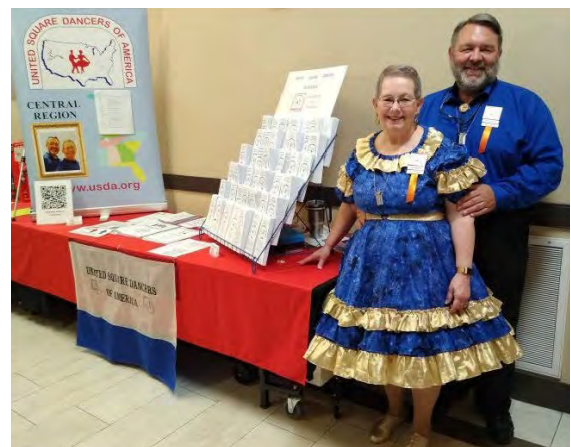
Three weeks later at the AL State Convention.