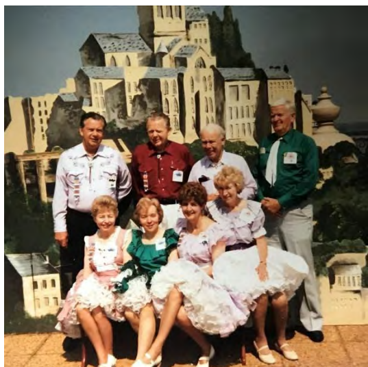
With Friends at Convention