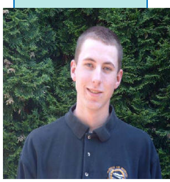
Where Are They Now? Let Us Know!